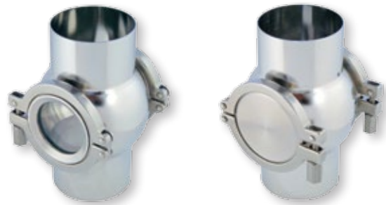
Inline housing with sight glass and blanking plate respectively

Other combinations available. Please request details.