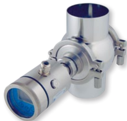
Inline housing with Inline instrumentation